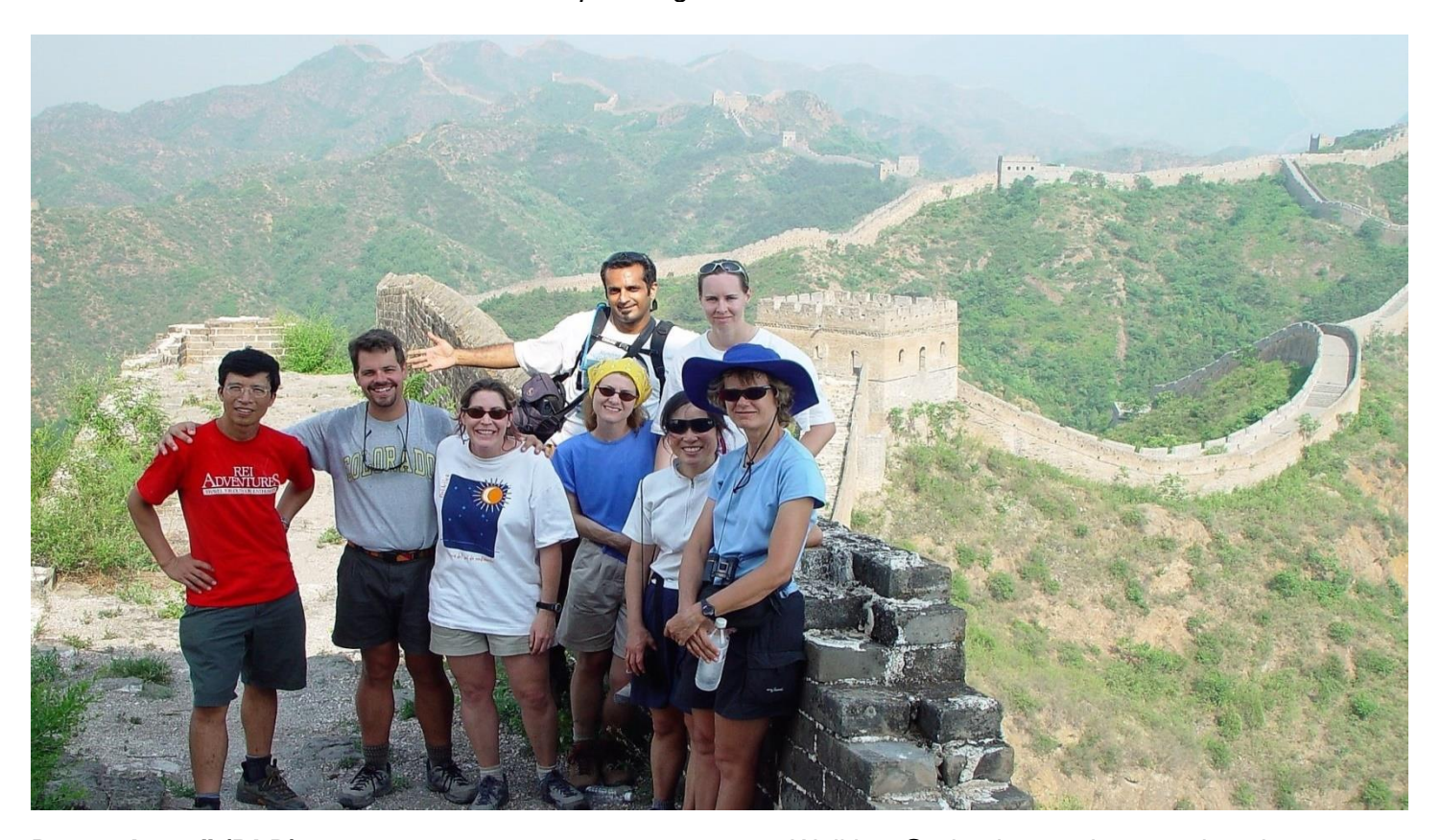
Day 13 Longji (BLD)

Possibly the most incredible rice fields in the world, Longji, or Dragon's Back was first created in the Yuan Dynasty (1271 - 1368) and was completed in the early Qing dynasty (1644-1911) spanning over 650 years. The rice terraces are built into the hillside and wind around the slopes like ribbons with the field colours and water reflections changing with the seasons. The village of Ping'an is over 300 years old and its inhabitants continue to wear traditional dress and follow their simple living customs.