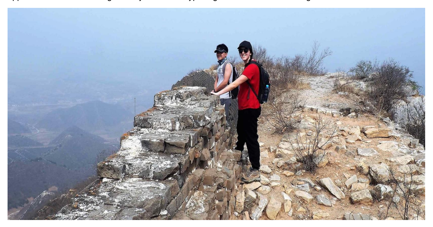
Day 5 Si Ma Tai - Beijing (BLD)

We set off early today for a full day guided walk through cornfields and farmland for a taste of true rural China, before exploring this classic section of the wall, well off the beaten track, known locally as the 'dragon standing on the beautiful golden mountain'. With broad sweeping views, it's easy to see the wall resembles a dragon's back weaving its way across the land. The views are stunning and you will have hundreds of great photographic opportunities. This evening we stay at another typical guesthouse in Jinshanling.