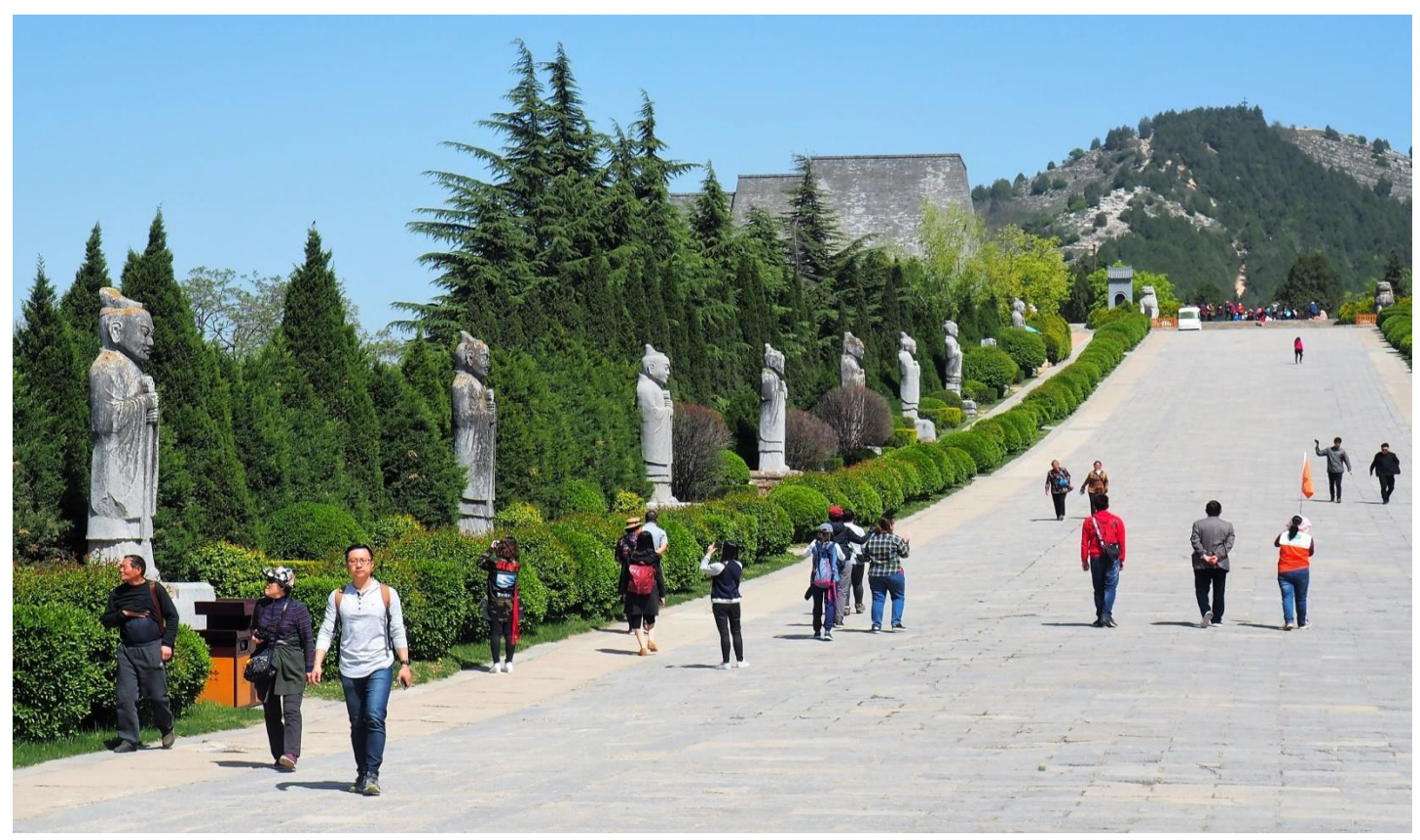
Day 10 Xian - Shanghai (BD)

After breakfast we transfer to the station for the train (first class compartments) to Shanghai where we stay for two nights in a central hotel There is time for an orientation walk here followed by dinner in local restaurant.