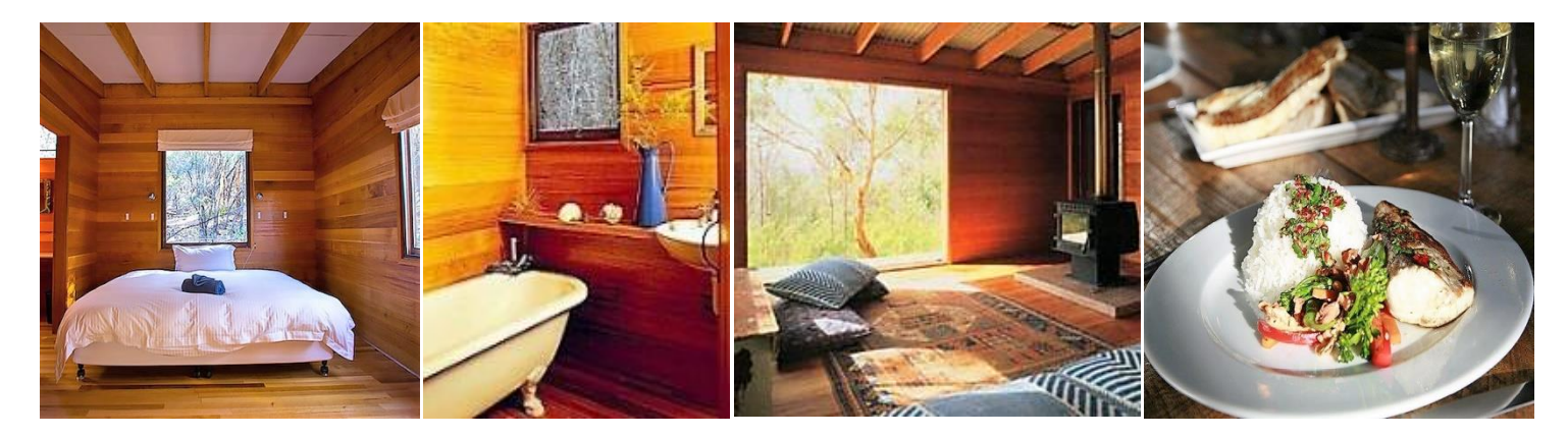
"The Freycinet Experience's combination of gorgeous landscapes and prevailing ethos of 'luxury without harm' is enough to leave visitors on a natural – and sustainable – high." Gourmet Traveller Magazine