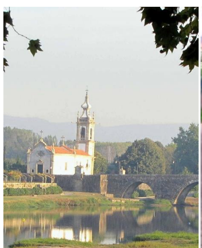
Day 7: Tui Walking tour arrangements end after breakfast.

A day that begins in Portugal and ends in Spain. Apart from a short climb to leave the Coura valley, most of the route is downhill on quiet country roads and forest pathways first to the walled town of Valença, and then over the river Minho / Miño, which forms the border between Portugal and Spain, to the historic town of Tui. Two bridges connect Tui and Valença and there are normally no formalities in crossing what is the busiest border-point in Northern Portugal. On arrival in Tui you may like to stroll through the picturesque streets of the town and take time to visit the 12<sup>th</sup> Century cathedral.