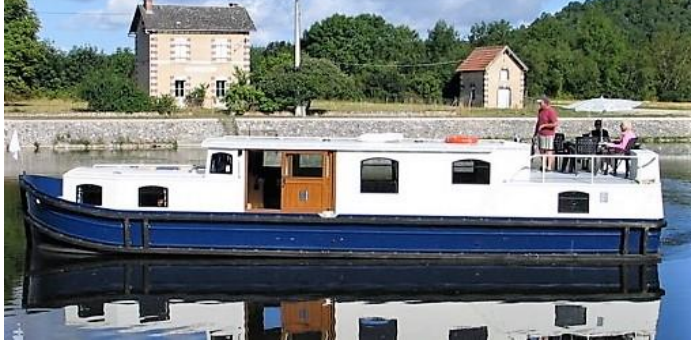
Classic 139 Classic 139 Grand Cru