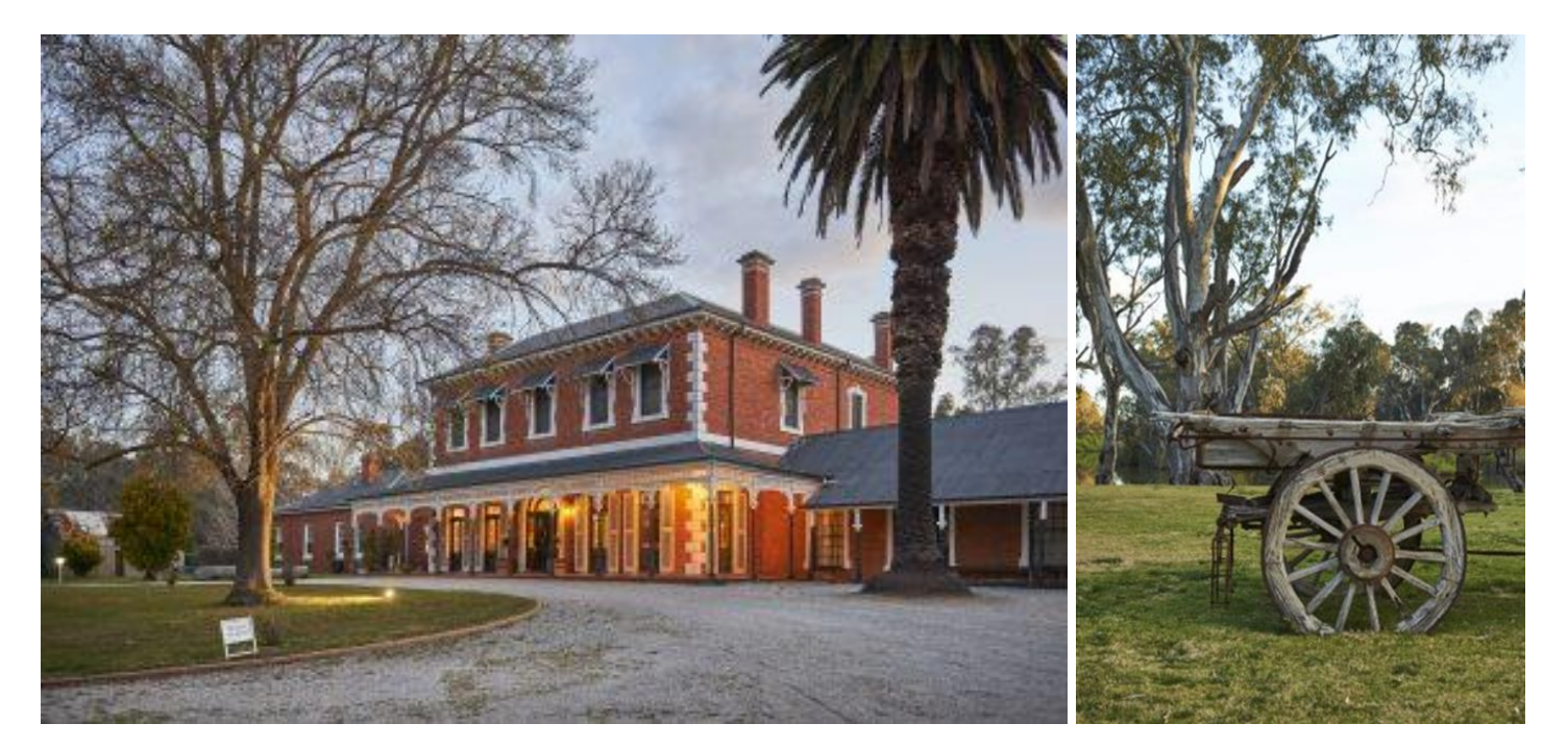
Day 4 - Moama Wharf

After breakfast embark on a half-day land and river tour. Explore the historic town of Echuca, discovering historic sites like Hopwood's Punt and pontoon bridge, the first river crossing established by Echuca's founder Henry Hopwood. Take in morning tea at Echuca Wharf, then board an eco-expedition boat for an intimate cruise upriver, learning about the rich history of the river from pre-European to early colonial riverboat days. Have a delicious lunch on a remote sandy river beach, surrounded by the majestic beauty of the river.