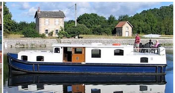
Classic 139 Grand Cru