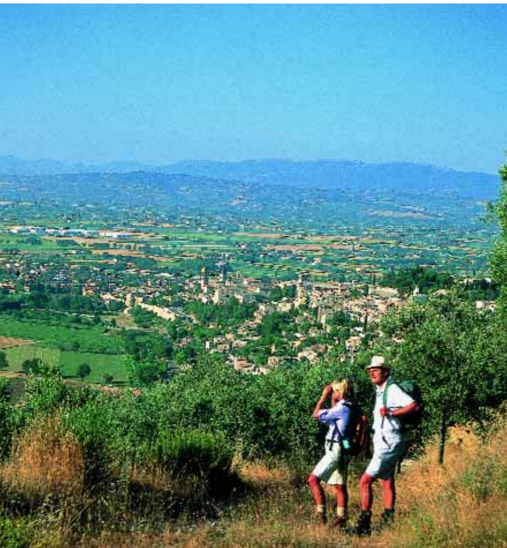
'Some of the finest Umbrian hill towns on route – Spello'