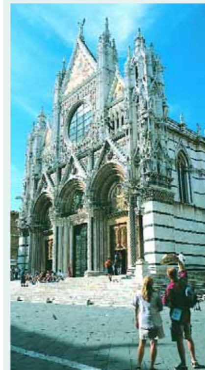
'medieval duomo of black and white marble'