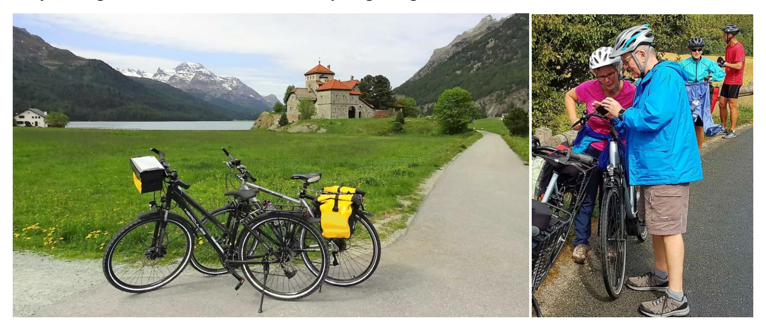
As seen with Lochie Daddo on Australia's Channel 9 TV Travel Show 'Getaway'.

7-days / 6-nights – inn-to-inn SELF-GUIDED cycling along the Inn River Trail