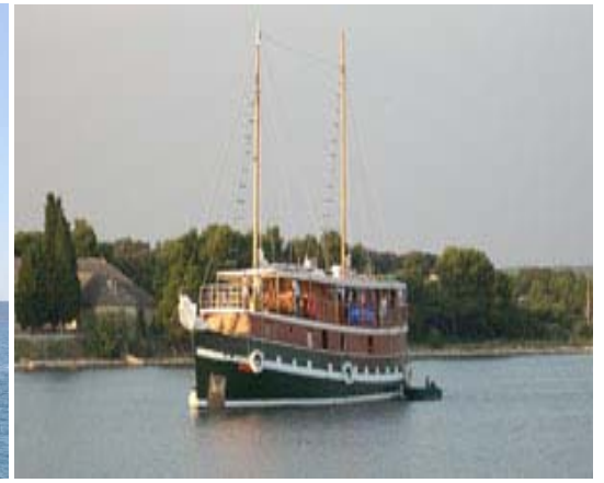
Our boats: The 'Linda'