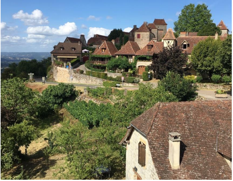
"..back from my trip and wanted to give you some feedback now that I'm over the jet lag. All the different bits were wonderful, especially the Dordogne walk.

We really should have taken a bit longer on the walk. It was quite tough, especially in 35 degree heat! The villages were gorgeous and on the whole the hotels very good. The only disappointment was my room in Rocamadour, 2.7m x 2.7m, no AC, 36 degrees and an awful bed. The highlight was Loubressac, which was truly beautiful. We all thought the indicative times for the daily walks were very optimistic. We seem to take at least an extra hour every day. It was all fabulous and recommended." Regards, Jennifer