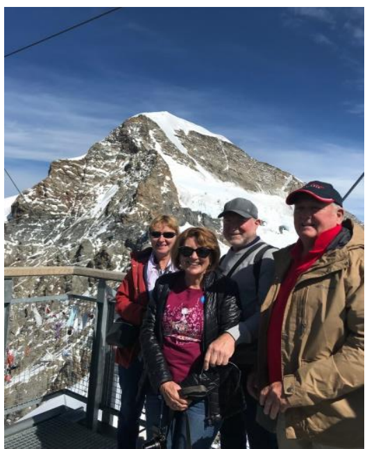
Thank you for organising such a wonderful trip for us! We had an amazing seven weeks together experiencing some very diverse parts of Europe.

Every aspect of the whole trip was seamless due to your excellent suggestions and preparation. You made the whole process of putting together our special holiday an absolute pleasure! We will not hesitate in singing your praises to anyone who asks.